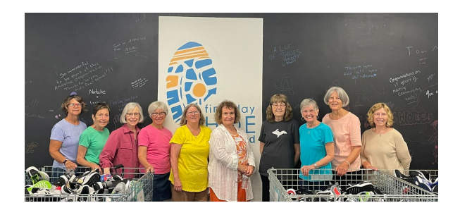
The KANC Volunteer Adventure Team helping this June

For those who are unfamiliar with FDSF, it is a local, grassroots initiative whose mission is to provide children in the Kalamazoo area with new shoes throughout the school year. The charity was chosen because of the great need for many students in the Kalamazoo Public Schools whose families don't have the resources to provide adequate shoes. Also, the fund does not have a large budget or funding source and our contribution to the fund will make a world of difference to many students.